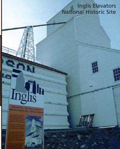
Inglis Elevators National Historic Site