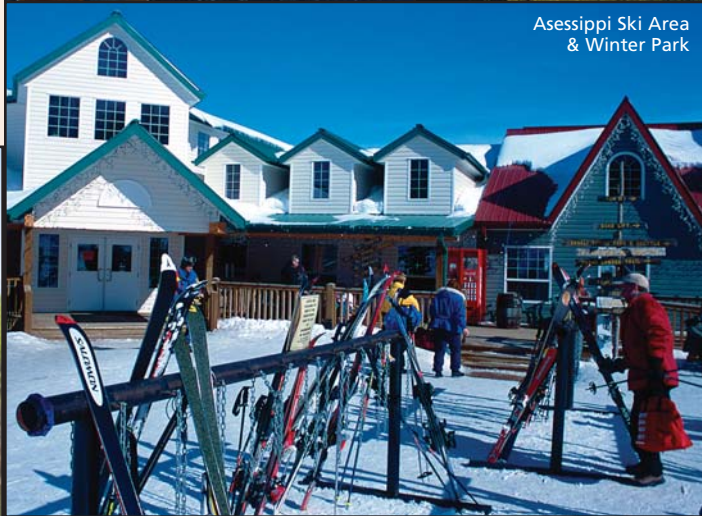
Asessippi Ski Area & Winter Park