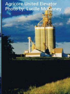
Agricore United Elevator