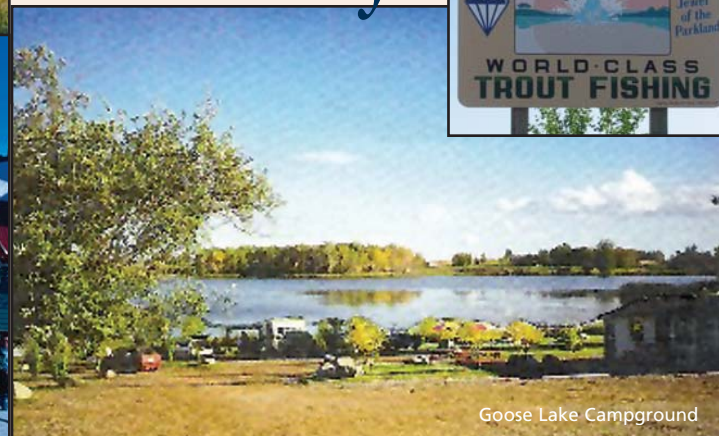
Goose Lake Campground