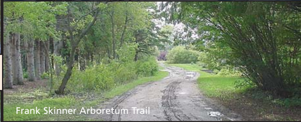
Frank Skinner Arboretum Trail