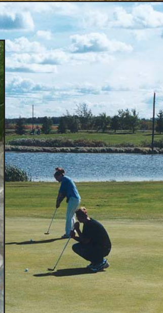
Roblin Golf & Country Club

TOWN OF ROBLIN Tel: (204) 937-8333 Email: toroblin@mts.net ECONOMIC DEVELOPMENT Tel: (204) 937-8640 Email: roblined@mts.net www.roblinmanitoba.com